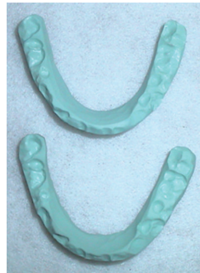
FIGURE 1: Custom-made intraoral appliance used for holistic temporomandibular therapy.

* Data are presented as mean ± SD (range).